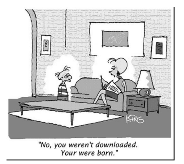
Figura 1. A typical figure